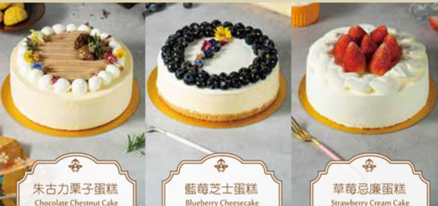
朱古力栗子蛋糕 Chocolate Chestnut Cake